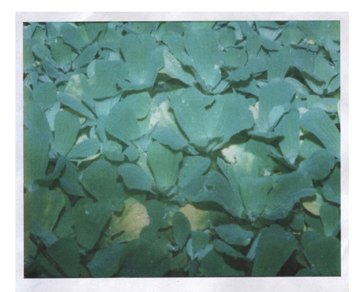
Plate 1. <u>Pistia</u> <u>stratiotes</u> L. (Duck weed) or Water lettuce. Collected from Hauren Shanu Pond near Gadon Kaya, South- Central Kano Metropolis (May 1999)